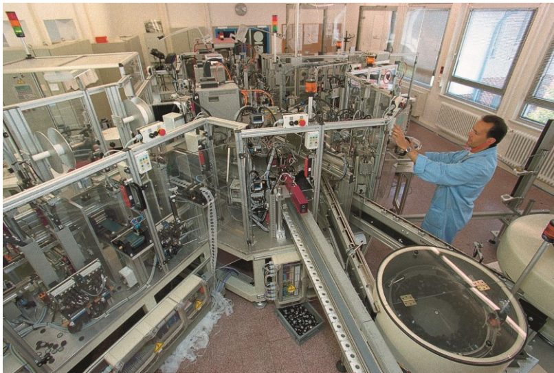
Setup of the initial manufacturing line for evolution microphones

quality microphones fully automatically – and we took the risk and invested in the necessary production lines.” Andreas Sennheiser adds: “They created the most modern microphone manufacturing line of the time, and the success immediately proved them right: Wireless sales surged tremendously.”